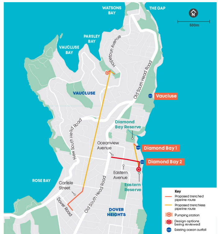
Refresh Vaucluse and Diamond Bay project map

Sydney Water’s Maintenance and Networks teams will also use the site as part of the ongoing operation and maintenance of the reservoir.