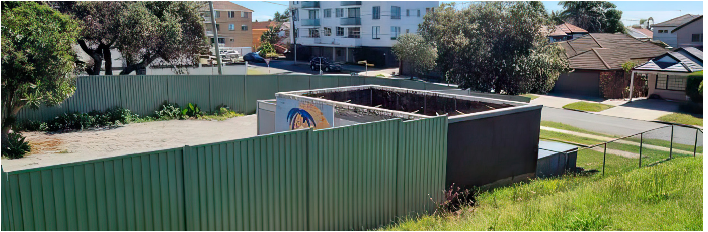
Proposed SW site office and laydown area