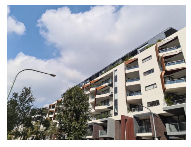
Apartments with balconies improve the liveability.