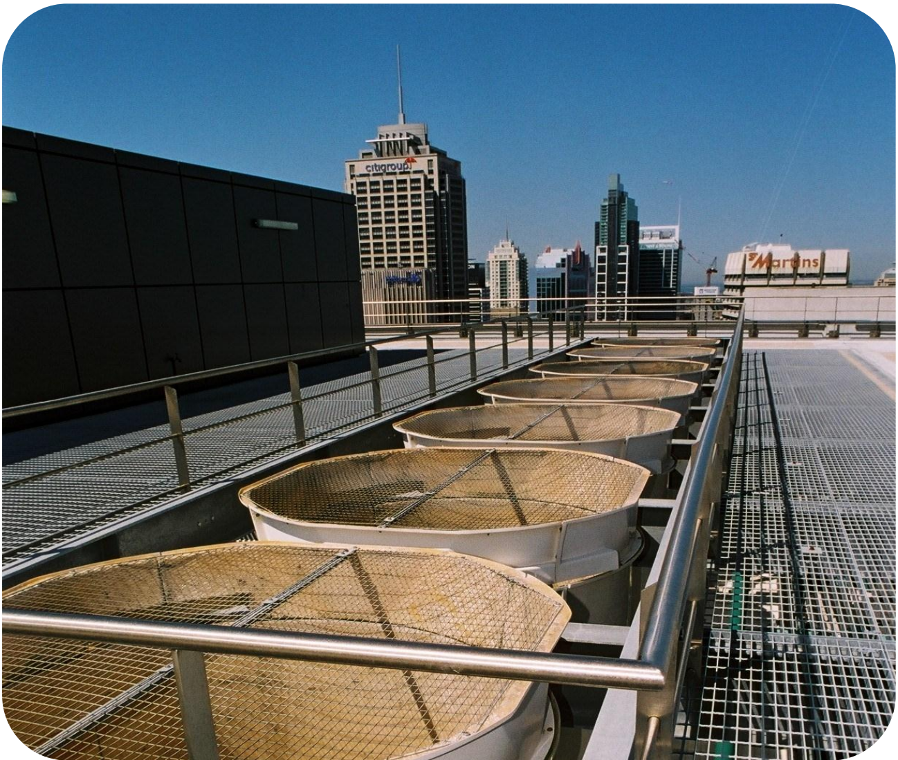
Recycled water produced from sewer mining can be used in the cooling towers of commercial buildings