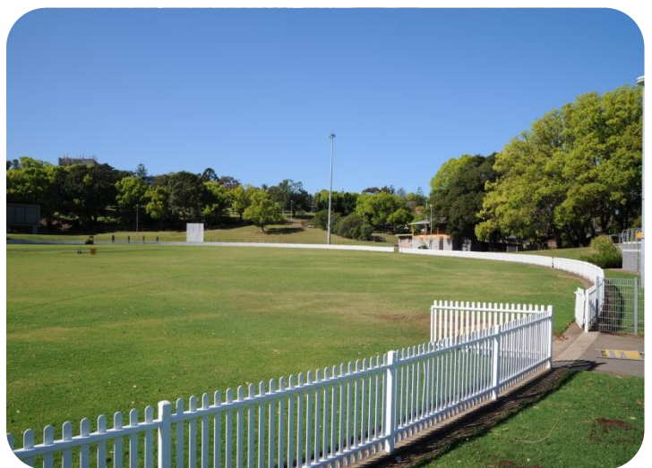
Recycled water from sewer mining can be used to irrigate sports fields