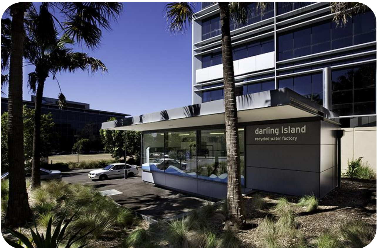
The on-site sewer mining facility at Workplace 6 produces over 10 million litres of recycled water each year