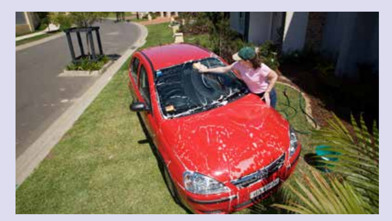
Recycled water is great for washing cars and watering lawns and gardens.