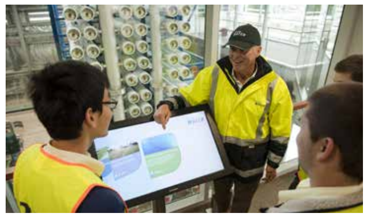
Students learn about the reverse osmosis treatment process at our St Marys Water Recycling Plant

For bookings and more information or to tour other Sydney Water recycling plants, email tours@sydneywater.com.au or call 1800 724 650.