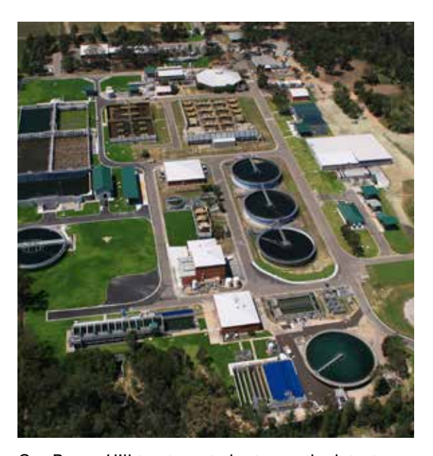
Our Rouse Hill treatment plant uses the latest technology to produce high quality recycled water.

Some city office blocks use recycled water from on-site treatment plants. These include Sydney Water's head office at Parramatta and workplaces at Darling Harbour.