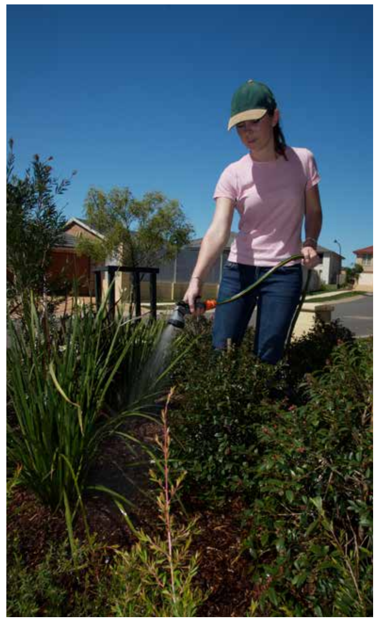
Using recycled water helps save precious drinking water.

We are recycling four times as much water as we did in the early 2000s.